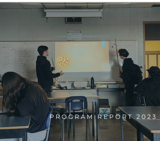
PROGRAM REPORT 2023